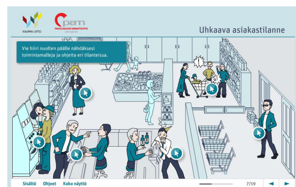
The tutorial shows potential threatening situations with customers in the shop.