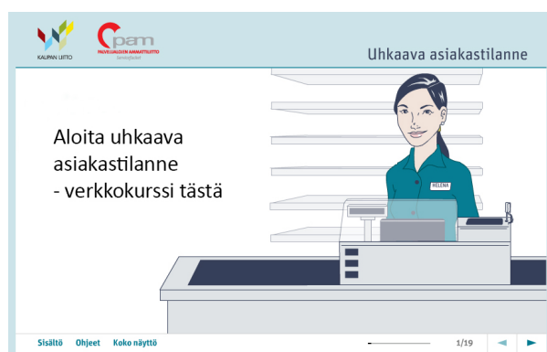
The welcome page of the third party violence online tutorial.

The tutorial gives details on how to catch a shoplifter safely and suggests what to do after a threatening incident, such as closing the store, calling the police, reporting the incident to a manager, a co-worker or a security guard. This part of the tutorial calls for interaction at the workplace, finding out what specific instructions have been introduced by the management. It also gives recommendations on seeking help from occupational health services for mental trauma.