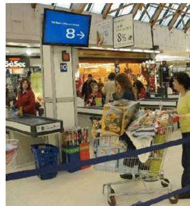
The customer waiting in the single queue is notified about the available cash desk by the screen.

However, the pilot showed that customers needed to be informed about the implementation of the single queuing system, leaflets and direct information by staff were given in advance of the launch. The single queue is only suitable in large stores where the distance between cash desks and shelving is at least 4.5 metres.