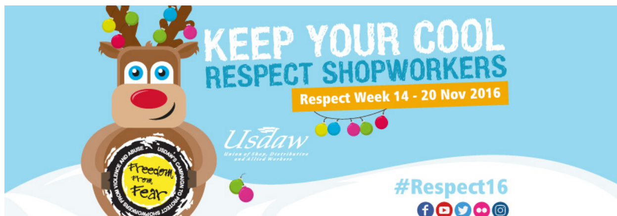
A poster promoting Usdaw's campaign to protect retail employees from third party violence.

The other aspect of the campaign is to protect shop staff from violence. This involves working with employers to ensure their duty of care obligations under health and safety law are met. However, it also needs local authority environmental health officers, who enforce health and safety laws in shops, to use their enforcement powers to ensure employer compliance.