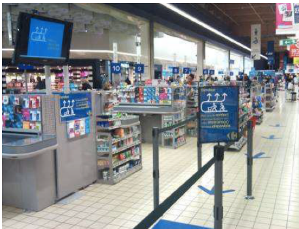
The single queue at a Carrefour store.

The goal was to diminish pressure on the cashier by minimising the queue at each cash desk in order to have a better distribution of work. The single queue allows easy closure of cash desks when cashiers are leaving or on a short break. The overall objective is to better address clients' needs through efficient organisation.