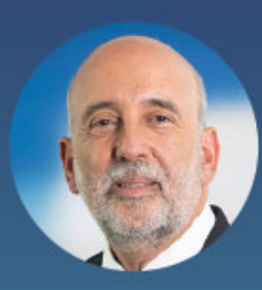
Gabriel Makhlouf Governor Central Bank of Ireland (via connection)